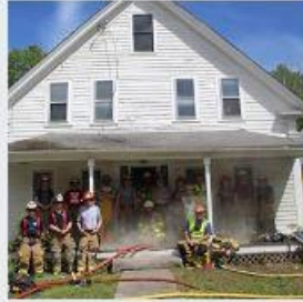
Townshend Volunteer Fire Department